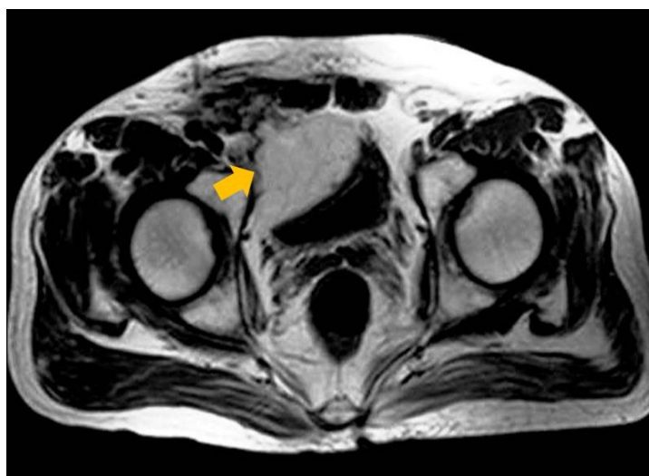
Figure 3. There was no residual lipoma around right inguinal region on postoperative Magnetic Resonance Image (MRI) although there was continuous unresected lipoma in the pelvic cavity (arrow).