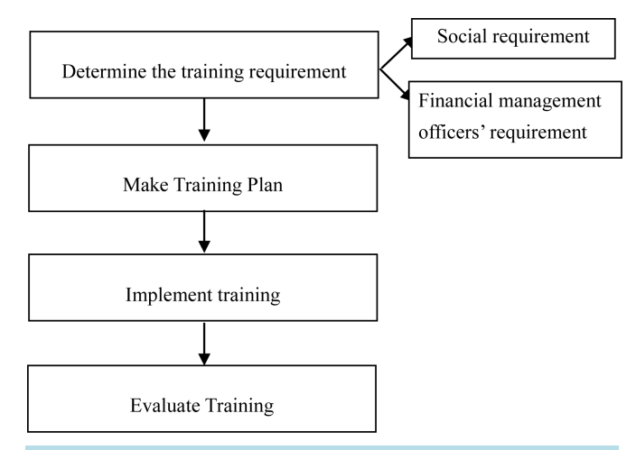
Figure 4. Financial management talents training pathway based on the professional competency.

Bringing experts to classroom, hiring enterprises and business experts as teachers to teach courses will ensure