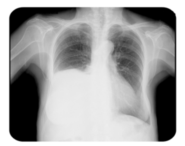
Figure 1. Chest radiograph showed elevation of the right hemidiaphragm.

CYFRA21-1, CA 19-9, NSE and CEA were within the reference values.