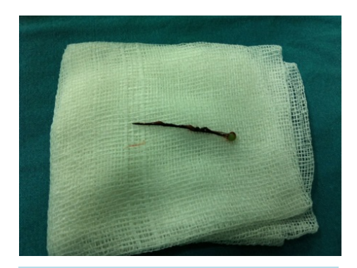
Figure 3. Removed foreign body (long pin).