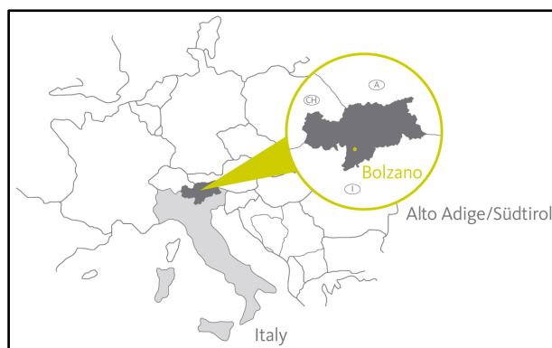
Figure 1. Map showing location of South Tyrol (Alto Adige/Südtirol) with Bolzano/Bozen shown as green dot ( http://www.altoadigewinesusa.com/about-alto-adige/ ).