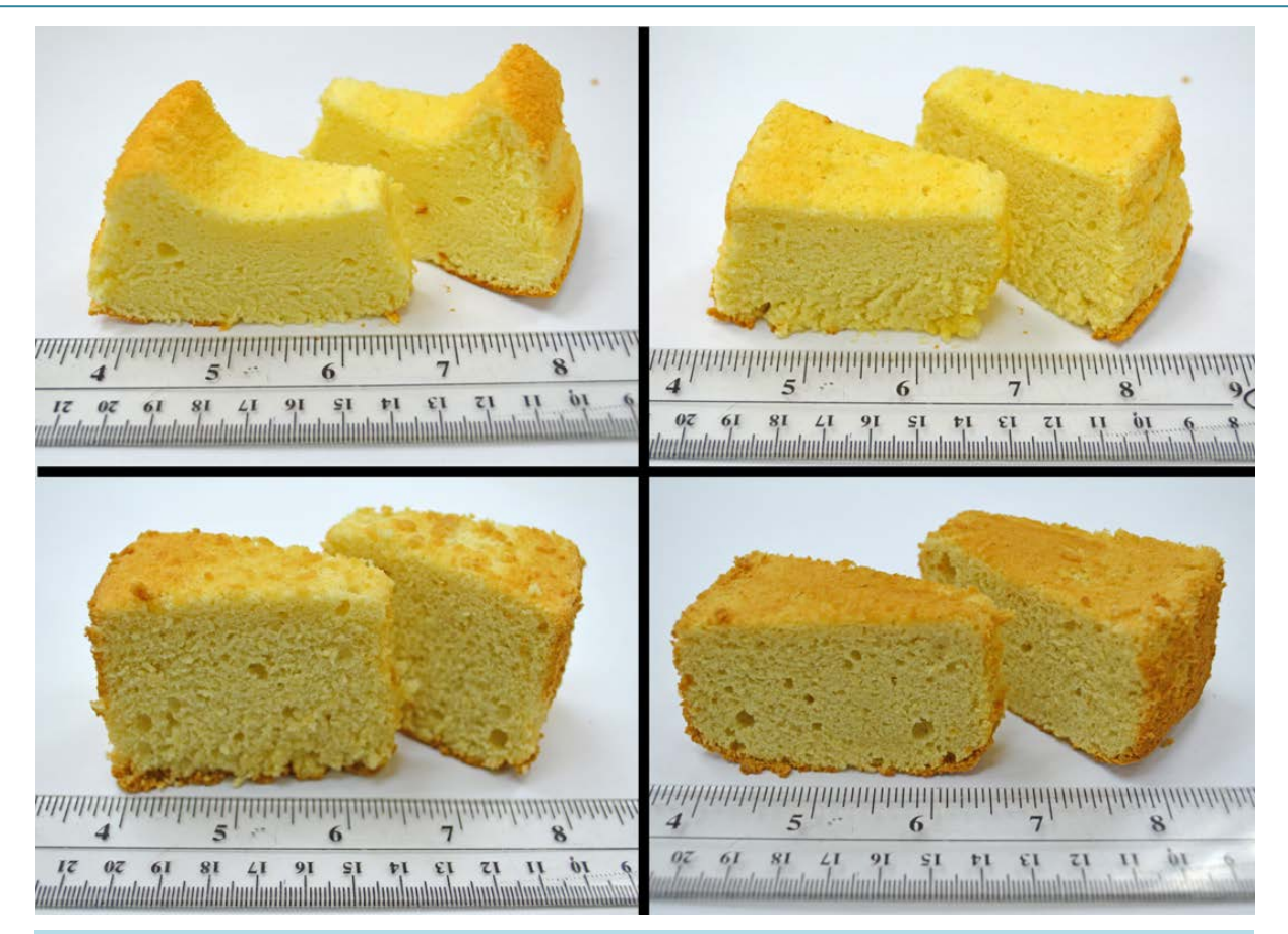
Figure 1. Chiffon cake prepared with 0% (left upper), 5% (right upper), 10% (left lower) and 15% (right lower) of YCP.