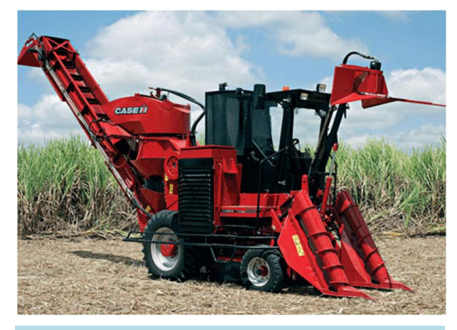
Figure 1. Harvester Case IH A4000