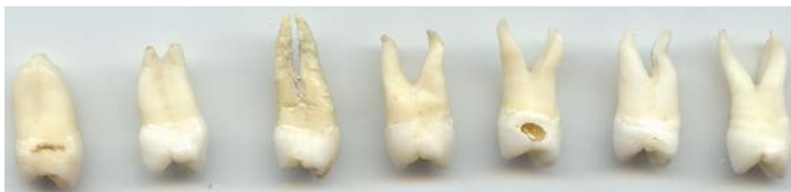
Figure 1. Collection of variation of first maxillary premolar.

The internal morphology of root canal system was studied as followed; teeth are cut at cement-enamel junction (CEJ) with turbine (W&H, Austria) with fissure burs nr.4 (Meisinger, Germany) under water, standard access was made in each tooth until the pulpal chamber. The teeth were stored in 5.25% sodium hypochlorite solution for two days to remove pulpal tissue. Teeth were then washed in tap water for 2 hours. Operating microscope (OP) has been made for apparent entry into the root canals, under \times 250 magnification. K file #6, #08 or #10 was inserted into canal, until the end of the root canal. Subsequently was making CDR (Computed Dental Radiography, Schick Technology USA) radiography, visualizing the internal topography of the root canal system.