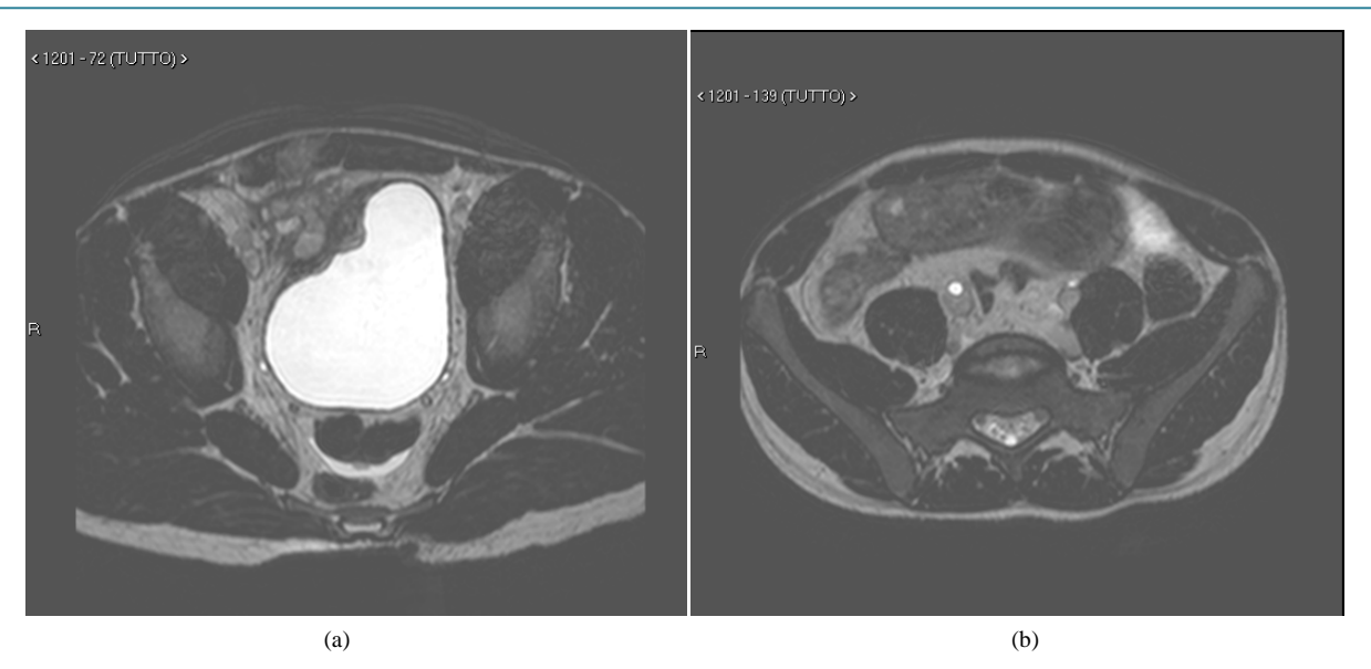
Figure 2. Ultrasound trasversal scan: Normal bladder, regression of the vegetating lesion.