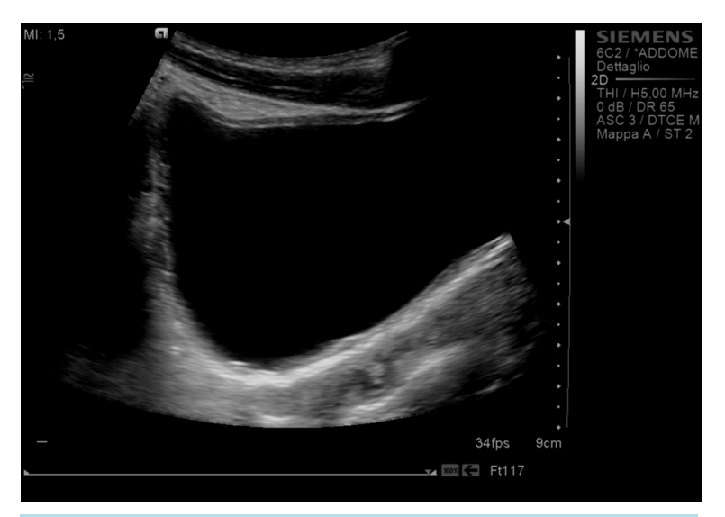
Figure 3. Ultrasound trasversalscan: Normal bladder, regression of the vegetating lesion.

The cystoscopy showed in the area of the dome of the bladder a superficial, large and sessilepapillary lesion, with a diameter of 1 cm. Histology specimens revealed a normal aspect of the urothelialepithelium. Therefore the lesion described was considered as an extroflession of the bladder mucosa, due to the compression exerted by the bowel.