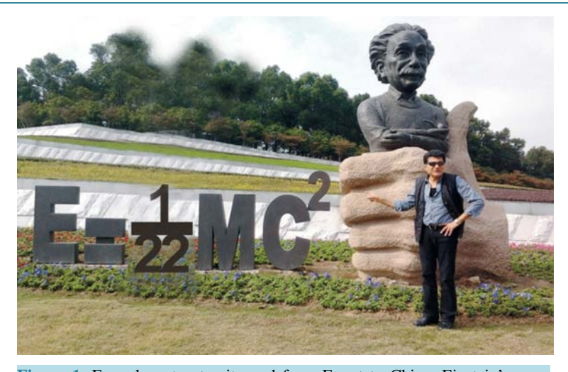
Figure 1. From here to eternity and from Egypt to China, Einstein's masterpiece of art eternalizes human high culture. In this real photograph only the quantum particle Lorentzian factor 1/22 was inserted into the photo taken in 2013 by the renowned Chinese applied mathematician, engineer and physicist Ji-Huan He. The complete dissected equation is of course (mc^2/22) + mc^2 (21/22) = mc^2 . The photo and E = mc^2 should be viewed with the sensitive eye of say the recent film of George Clooney and Matt Damon "The Monuments Men", Columbia and Twentieth Century Fox (2014).