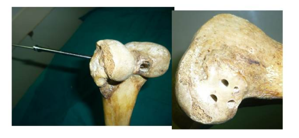
Figure 5. Pins inserted through inclination C achieved central position within the femoral tunnel (left image); however, penetrated the lateral cortex of the lateral femoral condyle (right image).