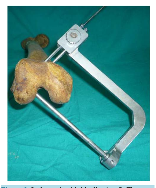
Figure 2. It shows the third inclination C. The cross pin guide was shifted to allow insertion of pins from the medial side. The inclination of the sleeves from anterior to posterior.

Inclination B: the proximal of the two cross pins had achieved a central position inside the femoral tunnels and remained within bone throughout its length. In contrast, the distal pin though passed through the femoral tunnels, its tip penetrated the posterior cortex of the distal femur (Figure 4).