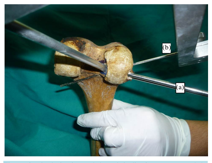
Figure 4. Distal pins inserted through inclination B penetrated the posterior cortex of the femur.

Inclination C: all pins driven through this inclination achieved central position within the femoral tunnel and remained within bone throughout the length of the pin. However, the tip of the drill pins had perforated the lateral cortex of the lateral femoral condyle and became laterally prominent (Figure 5).