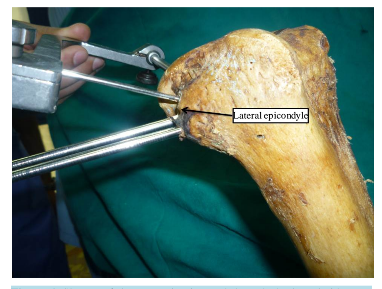
Figure 6. Sleeves of the cross pins inserted through the lateral side were very close to the Lateral epicondyle.

Table 1. This table defines the position of the femoral tunnels in relation to the Distal Articular Cartilage (DAC), Posterior Articular Cartilage (PAC) and the relation between Rigid-Fix sleeves driven through inclination (A) posterior to the Lateral Epicondyle as an anatomic landmark. All distances were measured in mm.