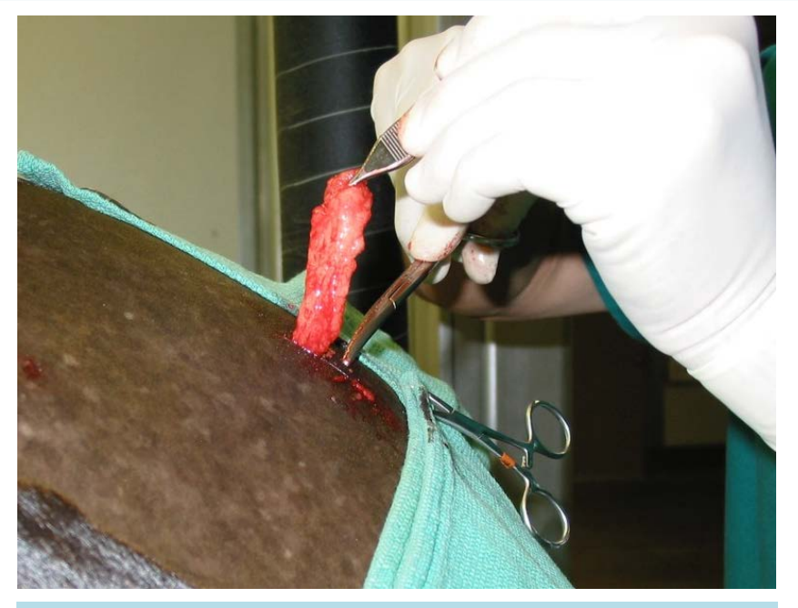
Figure 1. Aesthetic removal fat tissue from tail head region through a 2.5 cm incision.

or higher level. Horses were considered a success if they had a RFW at the previous or higher level of performance following treatment of their suspensory ligament tears, and remained at that level of performance for at least 1 year without re-injury. Horses were considered a failure if they had a RFW at a lower level of performance, developed a re-injury of the previously injured suspensory segment, or if their suspensory ligament tears did not heal.