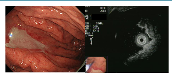
Figure 4. Endoscopic ultrasonography findings of gastric MALT lymphoma. A) Conventional endoscopy revealed an ulcerative lesion with fur in the greater curvature of the upper gastric corpus; B) EUS showed that the fourth layer was obscured, suggesting that MALT lymphoma had invaded the muscular and deeper layers.