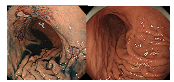
Figure 2. Changes in findings of MALT lymphoma on conventional endoscopy after successful eradication therapy. Scars with fold convergence were formed after successful eradication therapy.