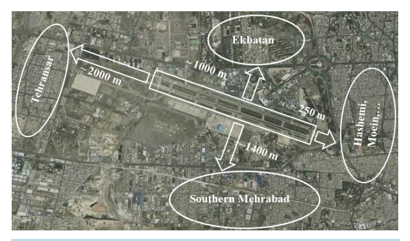
Figure 1. The minimum distance from airport runway to surrounding neighborhoods.

That is almost common throughout the world to consider a sufficient barrier between airports and settlements. For example, in the US, each county has their own ordinance established for airport zoning called Airport Overlay District (AOD). AOD is a proposed zoning designation that places restrictions and standards on prop-