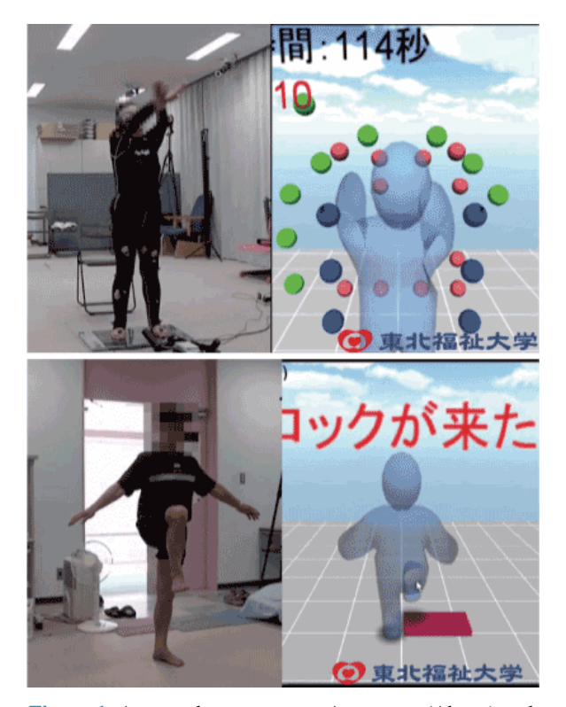
Figure 1. An actual game screen. Arm game (Above) and Leg Game (Below).

the game on both the left and right sides. One-leg standing time was set at 1 \sec \times 2 \sec , 2 \sec \times 2 \sec , 3 \sec \times 2 sets, 5 \sec \times 2 \sec , 7 \sec \times 2 \sec , 10 \sec \times 2 \sec , 20 \sec \times 1 set, and 40 \sec \times 1 set. For each stage, the game ended if the subject failed twice. Subjects with unstable balance during the game were allowed to use a T-cane if they wished to (Figure 1) (Below).