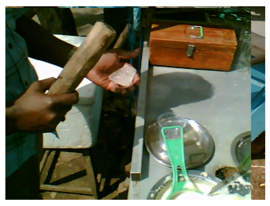
Figure 4. For Preparation of Fruit juices, the ice required is crushed in the hands; this picture is commonly seen during the preparation of food items by street vendors.