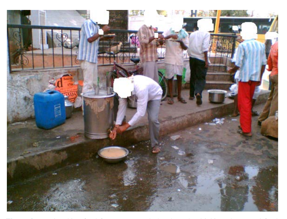
Figure 3. People taking food from street vendor's where the drinking glasses and food preparing vessels are kept open.