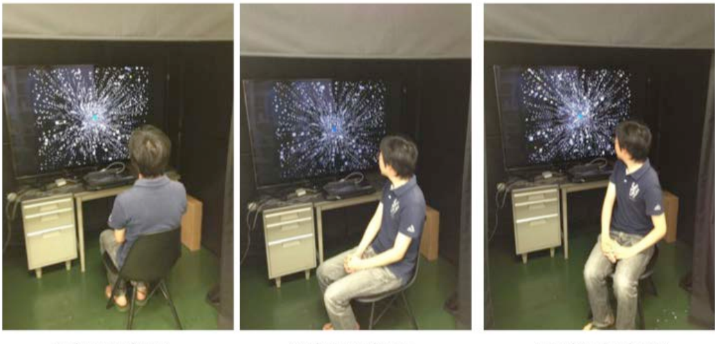
0 deg condition

In fact, there was the possibility that in the condition of extreme rotation (e.g. 135 degree), the observers might have continuous efforts to maintain such an unnatural posture, and then, their attention would be deprived from the vection task. Vection induction requires attentional resources (Seno et al., 2011). When the attention was deprived, vection should be weaker. In this study we could not deny this possibility. In future examinations, we should control the deprived attentional resources by the different postures.