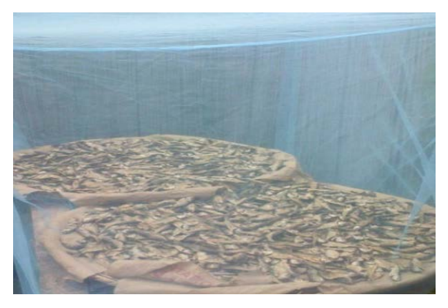
Figure 3. Improvement method of fermented-dried Lesser African Threadfin using clothes for protection against insects or others parasites.