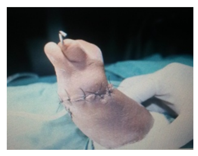
Figure 4. Post operative correction of medial deviation of the left hand.

nized congenital deformity characterized by hypoplasia of the bones and soft tissues on the radial aspect of the forearm and hand [1-3]. Above features are also typical to our patients.