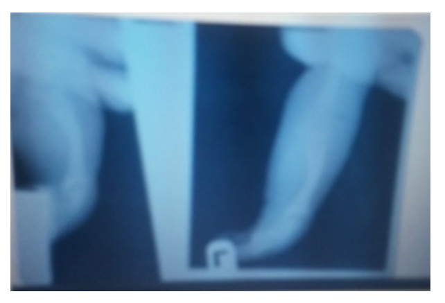
Figure 2. X-ray of the left upper limb showing absence of the radius with medial deviation of the hand.

Congenital radial club hand (CRCH) is a well recog-