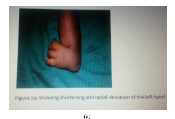
Figure 1b Showing shortening and radial deviation of the right hand