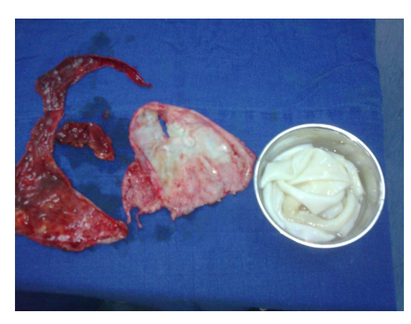
Figure 7. Peri cystectomy with proligere membrane.

brain 1a 5%, heart 0.5a 2% [2]. More exceptionally the thyroid, the pancreas, the ovaries, the articulations, the mild parts under coetaneous and muscular. The clinical symptom is variable, often dumb because of the deep localization at the level of the dome. Symptoms are in the late majority of the cases showing itself enough at the stage of complications such the break in the biliary ways or the pleura. The pain of the right hypochondria is the most frequent clinical sign [3]. The fortuitous discovery is especially more and more noted during a balance sheet.