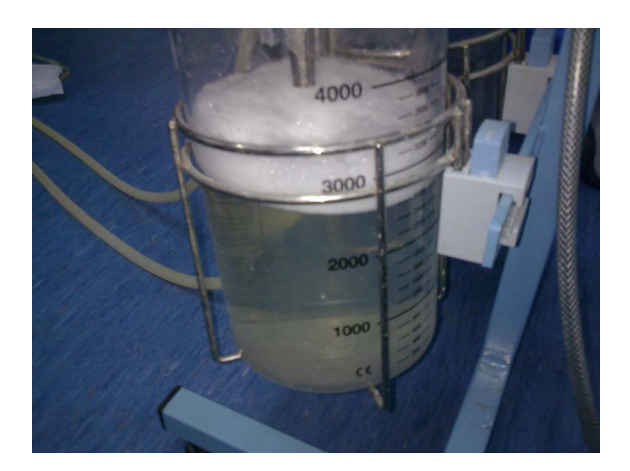
Figure 5. Aspiration of 3litres of clear liquid: water of rock.