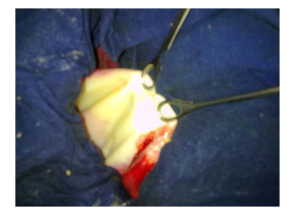
Figure 4. Exposure of the operative field with aspiration of the cyst.

lived as a parasite dog or indirectly by consumption of soiled food [1]. Embryonic eggs, eliminated in the outside