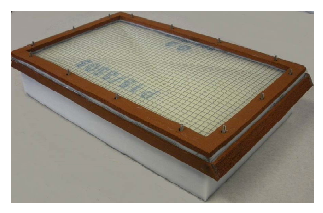
Figure 1. Picture of the exhaust filter for the Animal Enclosure Module (AEM).

The exhaust filter in the AEM is designed to prevent the escape of particulate matter into the cabin atmosphere, as well as contain animal odor and neutralize urine within the AEM. The exhaust filter, rated for 45 days of odor control, is made up of 9 layers including Bondina, fabric sorbents, activated carbon, filtrate, and zeolite, as shown in Figure 2 . Layer 1 directly exposed to the rodent chamber. This layer, as well as layer 4, consists of phosphoric acid (H<sub>3</sub>PO<sub>4</sub>) treated Bondina with 20 g pre-loaded H<sub>3</sub>PO<sub>4</sub> impregnated on the surface of Bondina for removal of alkaline gas, such as NH<sub>3</sub> and amines. Layers 2, 3, 5, and 7 consist of nonwoven fabric with evenly distributed holes for airflow, provide excellent liquidretention and