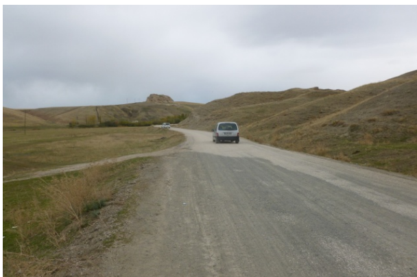
Figure 3. The cracks and repaired road sections on Van-Alakoy village road.

The effect of the earthquake being local on a few points in the region along with quick and efficient responses should not be deceptive and not to cause the underestimation of the requirement of the enough human sources, mechanical equipment stock as well as taking the measures of the maintenance work before the earthquake for the transportation systems prone to high scale