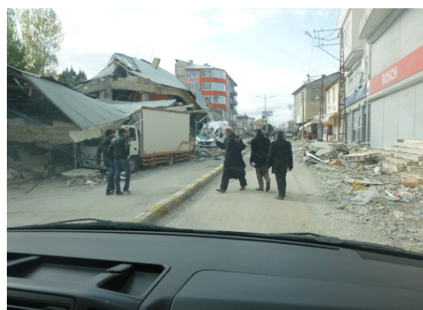
Figure 10. Vehicles trapped under the collapsed buildings.

centre revealed the fact that even major buildings did not have such facilities. The importance of this emphasised during the technical meetings with the local authorities and they were asked to show zero tolerance for the non-construction of these basements as the construction would increase the cost of the building to some extent.