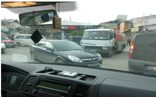
Figure 6. The chaotic structure of the central traffic flow at the town of Ercis.