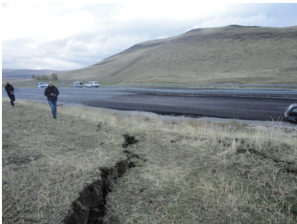
Figure 2. The effect of fault mechanism on Van-Ercis state road and its repair.