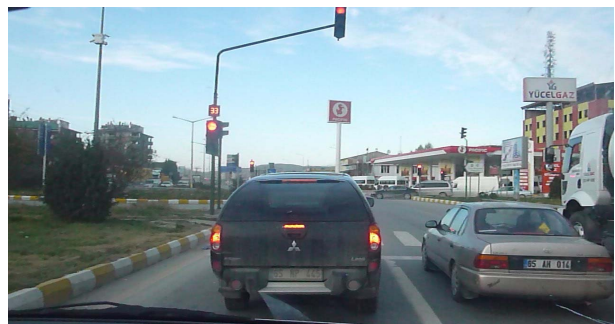
Figure 1. Signalised intersection between the airport and the Van city centre after earthquake.

As for village roads; Van-Alakoy road was determined as the one physically affected by the fault. Nevertheless, as the cracks were repaired quite rapidly, the traffic flow and connection were not affected. The Figure 3 gives an idea about the size of the cracks on the road and their repairs providing smooth traffic flow.