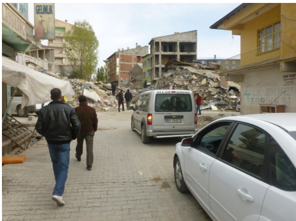
Figure 9. The effect of collapsed buildings on the town centre traffic in Ercis.

especially the heavy ones, carrying aid materials, the traffic assignment and parking locations of these vehicle must be predetermined, which was not the case in Ercis. This would certainly provide the fastest arrival of these vehicles to the points where they are needed by minimising their possible adverse effects to the daily traffic on the network. The fact that around 150 articulated lorries demanded to use the network daily in the first three weeks to provide the urgent needs for the people of Ercis with the population of 90,000 caused the network to be much busier and slower than the pre-earthquake state. The size and number of these vehicles were beyond the capacity and physical structure of the town network for a smooth and efficient traffic flow. It is quite clear that this becomes much more important for a possible earthquake affecting major cities with a population more than couple of millions.