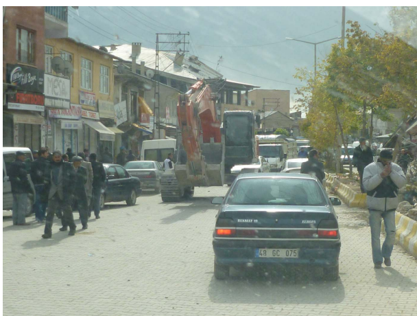
Figure 7. The effect of earth-movers on Ercis town centre traffic.