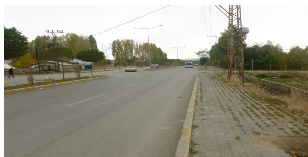
Figure 4. The Ercis ring-road after the earthquake.

The average travel speed is measured about 15 km/h (around 10 mph) at the town centre. The reason behind this low speed is attributed toon the one hand the capacity reduction of the roads, on the other hand the insufficiency for the applied traffic management and arrangement techniques along with the disobedience of the drivers and pedestrians to the traffic rules. The effective and efficient arrangements of horizontal and vertical traffic signs within a short period of time would result in a better traffic movement in terms of the physical capacity usage of the road network.