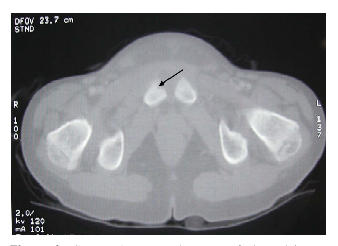
Figure 3. Computed tomography scan of the pelvis: an osteolytic appearance of pubic symphis.