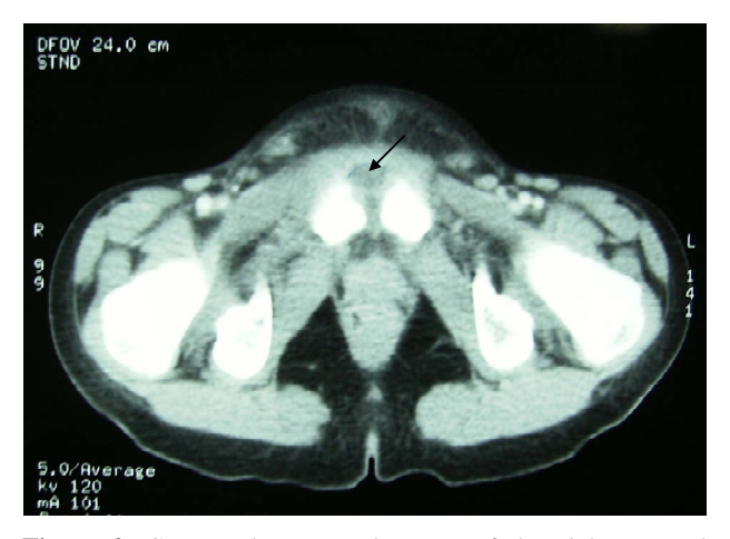
Figure 2. Computed tomography scan of the abdomen and pelvis revealed a hypodense collection arround the pubic symphis.