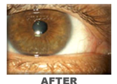
Figure 2. Pterygium after excision.