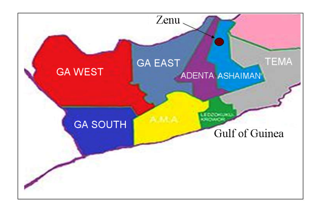
Figure 2. Geographical location of the Zenu community of Ashaiman in the Greater Accra region of Ghana (Adopted and modified from en.wikipedia.org/wiki/Ashaiman Municipal District).

Like the other rural areas within the region, the major economic activities of this community are subsistent farming and fishing with a few inhabitants being civil servants. The presence of a lake in the community might have attracted most of the settlers. The lake serves as a great source of water supply for various domestic activi-