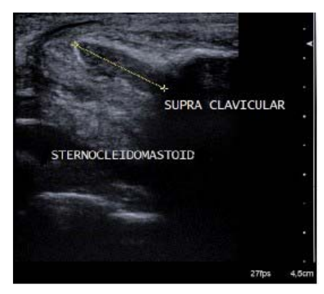
Figure 1. Right clavicular ultrasound showing liquid image in the sternoclavicular articulation measuring 39 \times 24 \times 0.5 mm with calcification representing arthritis.