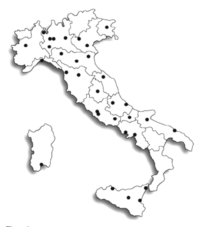
Figure 1. Distribution on the national land of the universities involved in the survey.