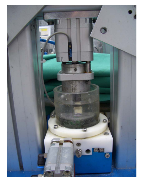
Figure 2. Simulation of the moisture and temperature changes in the oral environment in a mastication device with warm (55°C) and cold (5°C) distilled water (6000 cycles).

Additionally, the Adhesive Remnant Index (ARI) was determined. The classification of the ARI-index was as follows: "0" means that there is no composite left on the enamel. The score of "1" shows, that it remains less than 50% of the composite on the enamel. The score of "2" indicates that more than 50% of the composite remained on the enamel. And the score of "3" means that all composite remained on the enamel.