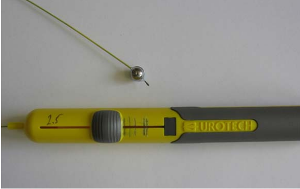
Figure 1. On the handle we established a non-linear scale in mm by grabbing standardized balls, normally used for ball bearings and standardized cylindrical steel rods for the smaller size.

The scale is nonlinear because of the nonlinear relation between the diameter of the stone and the distance of the slider and also because of the different materials of the basket (nitinol) and the spring (stainless steel).