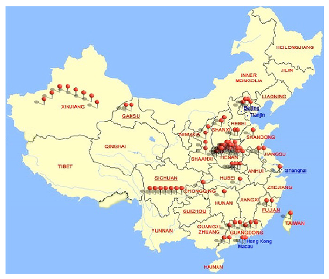
Figure 2. Representation of the number of HPV-OSCC studies carried out in various provinces in China.

Ag—HPV Antigens; CP—consensus primers; GP—general primers; HB—histological biopsy; IHC—immunohistochemistry; ISH— in situ hybridization; PCR—Polymerase chain reaction; SB—southern blot hybridization; FFPE—formalin fixed and paraffin embedded; N/A—Not applicable as study did not include controls; ND—Not Determined; UNK—Unknown due to insufficient information for determining study type; NS—not specified.