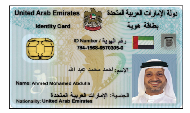
Figure 2. UAE smart identity card.

UAE has set a clear vision for digital identity issuance in the country. Figure 2 depicts the smart identity card issued by the UAE to all of its citizens and residents. This comes as part of its national identity management program (also referred to as national identity management infrastructure) that was launched in mid-2005. In the seven short years since its launch, UAE has been a leading country in the Middle East and Africa in issuing more than 8.5 million digital certificates to its population. This represents 96% of its total population—99.9% of the citizens and 95% of the expatriate resident population. The digital identity provided by the UAE is composed of a set of credentials delivered in the form of a smart card, which includes a unique national identification number, biometric data (fingerprints), and a pair of PKI digital