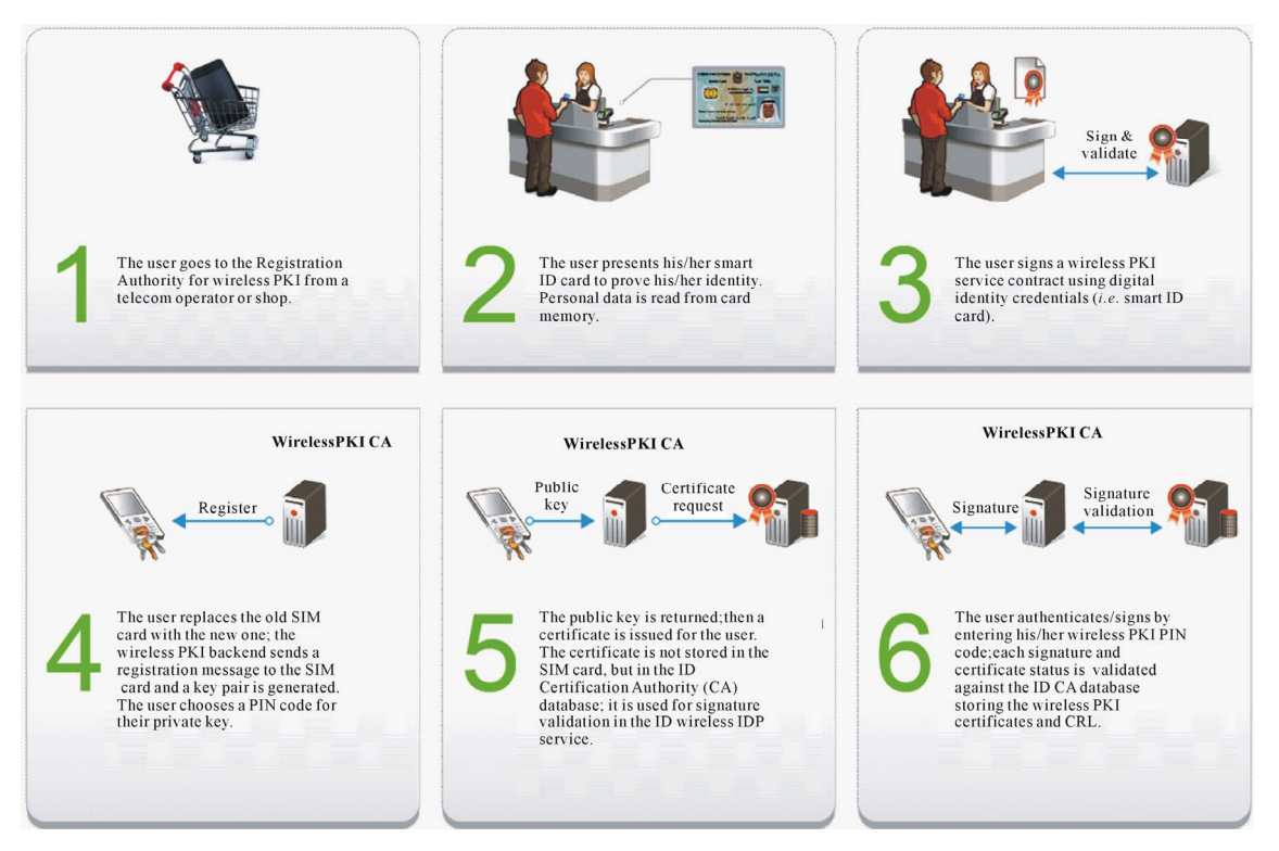
Figure 6. Wireless PKI registration and usage.

nication technologies will push governments to rethink their "role" and definition of "identity" in the digital world.