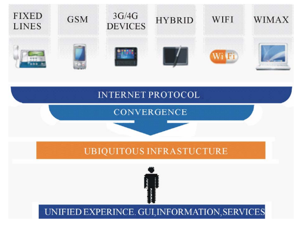
Figure 1. Convergence of digital technologies and citizen interfaces.

In reality, there are multiple providers of identity for any given entity, all jostling for space, which enable cross verification and authentication over diverse services. Thus, as long as the services are virtual, inter-dependent identity verification can suffice. Yet, with real services like physical goods, secure communication enablement, and financial transactions, higher trust requirements are needed for the completion of the transactions.