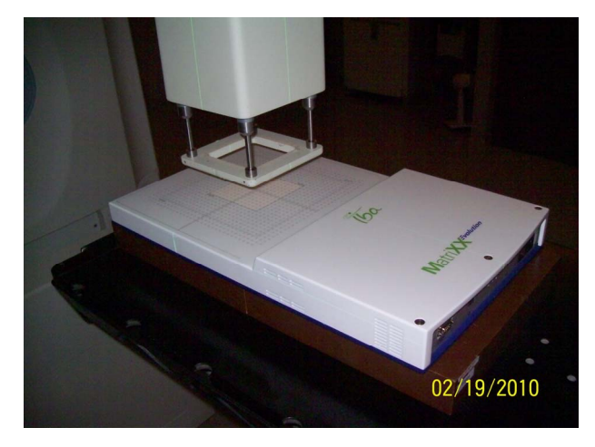
Figure 1. MatriXX setup on a linac treatment tabletop. A proper thickness of Solid Water would be placed on the surface during measurement.