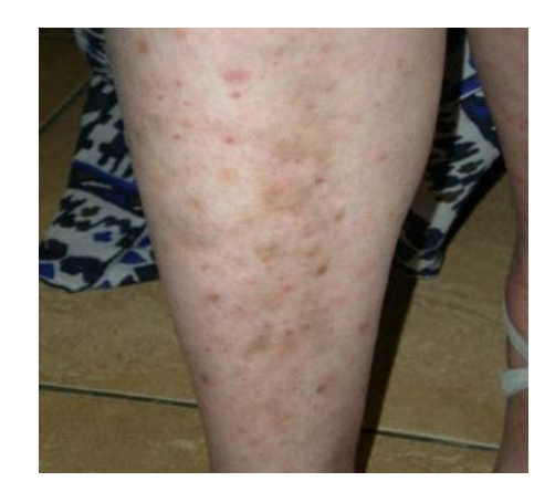
Figure 2. Purpura on the lower limbs.

showing that there was a new disturbance in the immune balance. In order to complete the investigations and taking into account the clinical context, we performed the biopsy of the lateral cervical masses . The biopsy result, with histological and immunohistochemical evaluation revealed the presence of severe small B cell infiltration (marginal type) with plasmocitic infiltration and Kappa chains secretion, with high proliferation index (see Figure 3). The diagnosis was of a diffuse Non-Hodgkin MALT lymphoma, with B type small cell. After we established the diagnosis, we directed the patient towards a hematology unit.