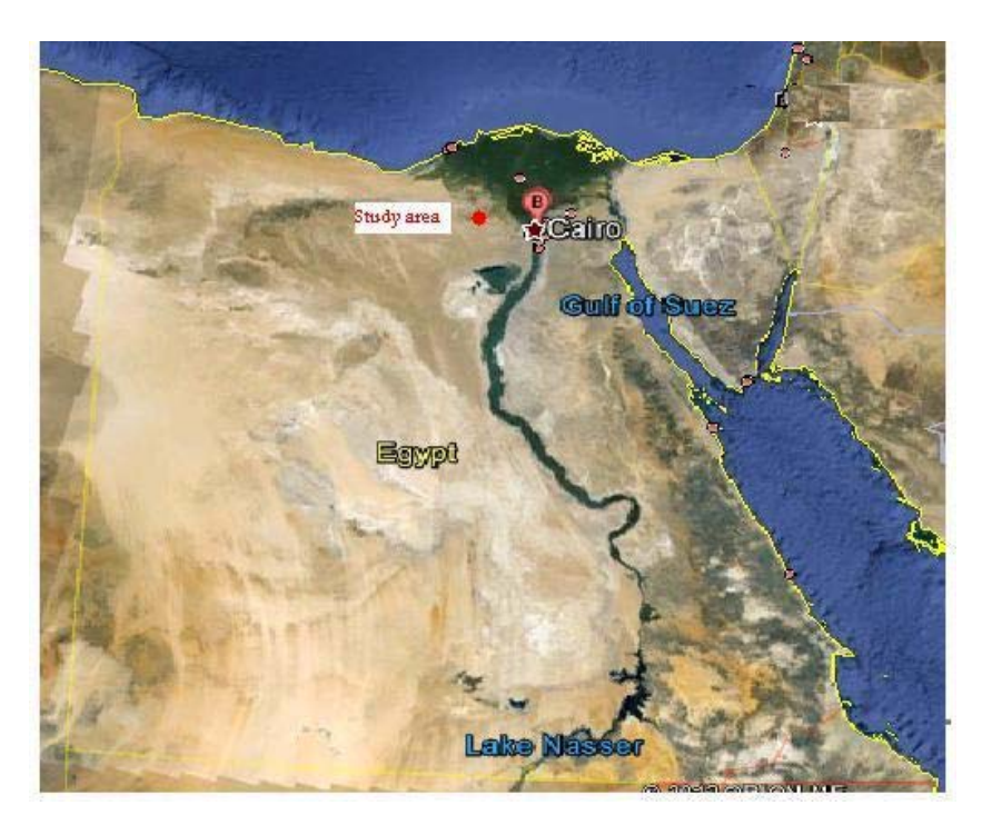
Figure 1. Location of the study area (solid red).

Table 1. Soil properties of the studied sites.