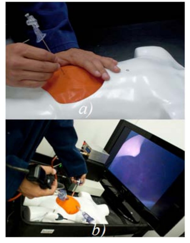
Figure 2. (a) Puncture with a Veress needle; (b) Insertion of trocars with video assistance.