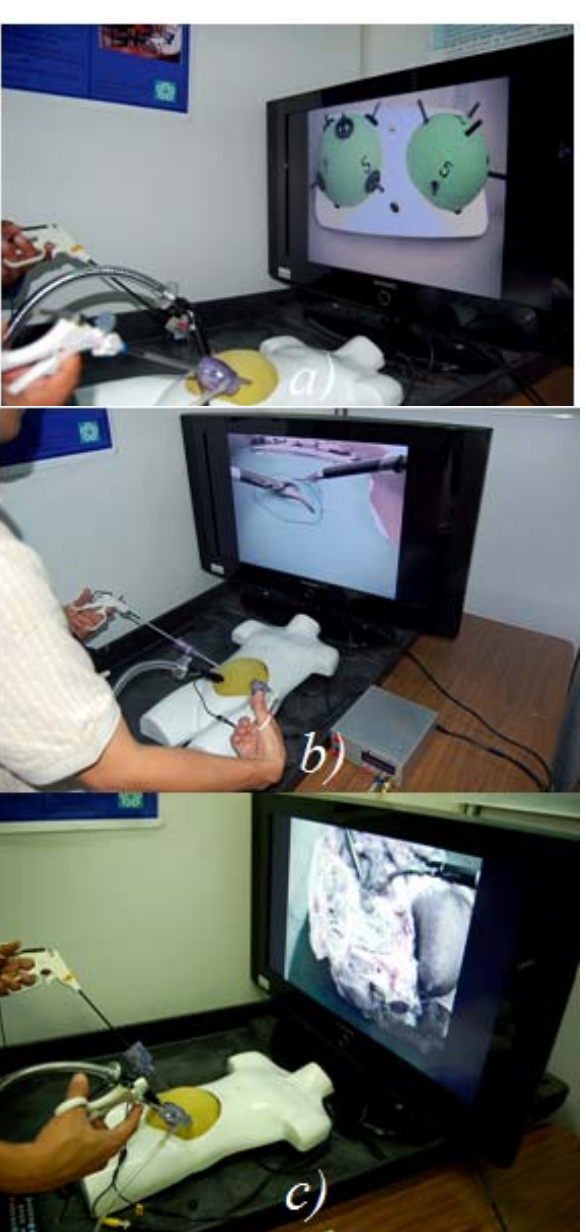
Figure 4. Tasks inside the pressurized chamber: a) Transferring rubber rings; b) MISTELS cutting task modality; c) Animal model dissecting.

safe ranges are not considered because this possibility does not exist in current trainers.