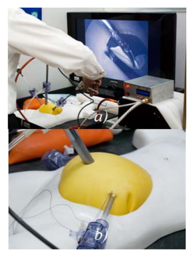
Figure 3. (a) Cutting task inside the pressurized chamber; (b) Suture to fix the trocar to the proper height.