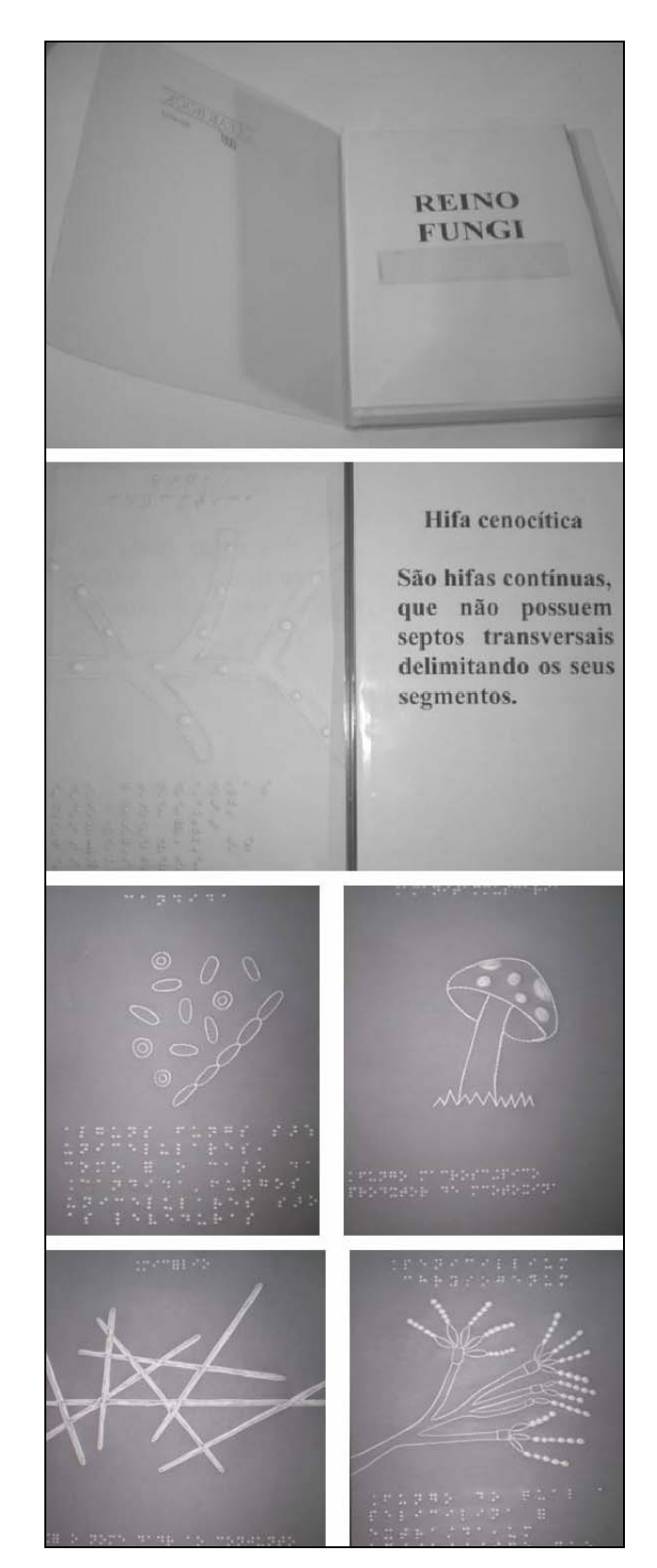
Figure 2. Atlas of Fungi Kingdom created to help teaching people with special visual needs. The booklet contains embossed drawings of different types of fungus, the explanatory text in Braille for blind students and increased caption size letters for visual impaired students.