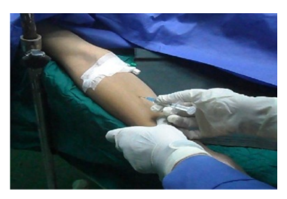
Figutre 3. Subcutaneous injection.

One of the major drawbacks to the use of intravenous DCS in compromised airway is the probability of losing patient's cooperation for opening the mouth and to be