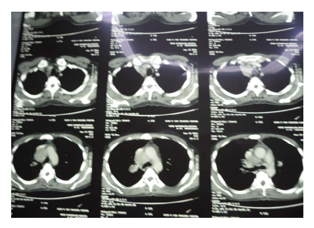
Figure 2. CT view of the tumor localization.