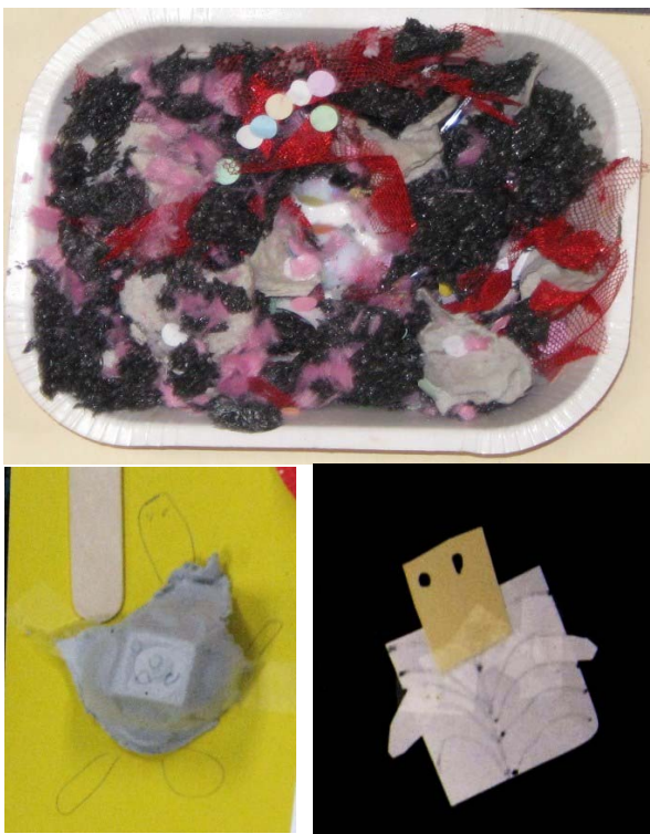
Figure 5. Different students' constructions of parts of the sea turtle life cycle.

discuss the creative strengths exhibited by the student. Figure 2 shows parts of student products related to the bean plant life cycle. The sprout was made with a cut portion of the green plastic palm tree drink stirrer thrust into the gray egg carton cup that represented the soil, a creative idea because the student modified the given pieces rather than using them as a whole (creative strength of breaking boundaries).