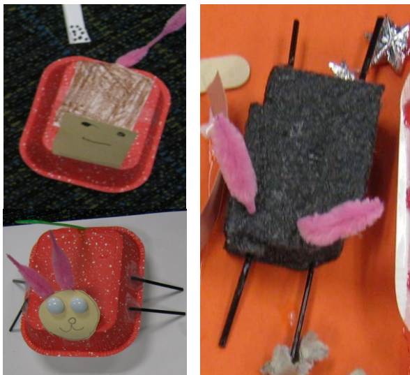
Figure 4. Three different students' foals from the horse life cycle.