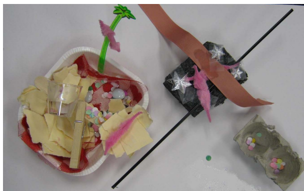
Figure 1. Example entire life cycle product made by second grade student.

cycle components, in a similar manner to this student's work.