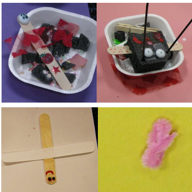
Figure 3. Student's work related to the dragonfly life cycle.