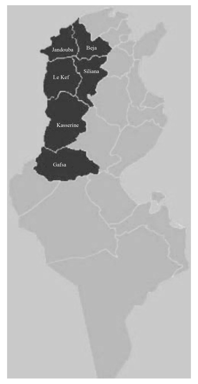
Figure 1. Localization of the Tunisian states where the commercial marble samples were collected.