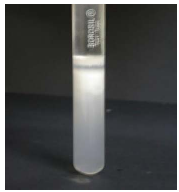
Fig. 2 Growth of SrNH<sub>4</sub>MgHPO<sub>4</sub> crystals within sunlight exposed medium