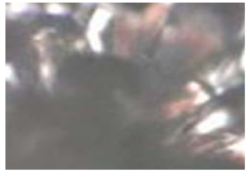
Fig. 5. Etch pit pattern of SrNH<sub>4</sub>MgHPO<sub>4</sub> crystal.

A well-grown SrNH<sub>4</sub>MgHPO<sub>4</sub> crystal was immersed in HCl solution at a desired concentration. The dissolution of the SrNH<sub>4</sub>MgHPO<sub>4</sub> crystal depends on the etchant concentration, temperature, crystal morphology, etching time etc. Fig-5 shows the etch pits of SrNH<sub>4</sub>MgHPO<sub>4</sub> crystal [28-31]. The etch pit patterns are observed as spirals, dendrites, vallies of ups, downs and straights.