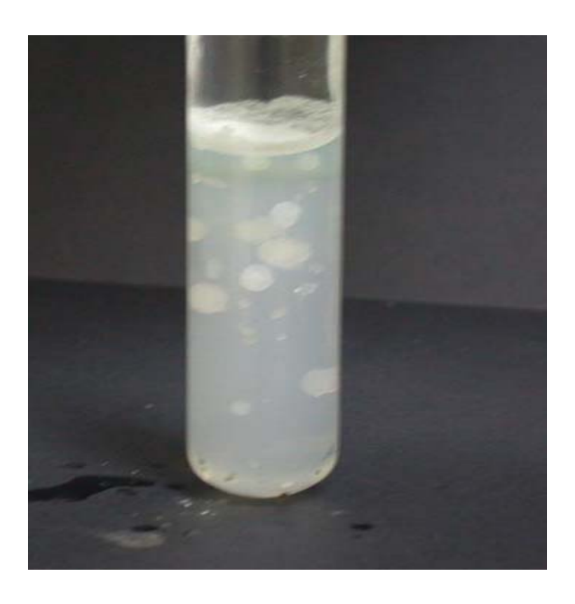
Fig.1 Growth of SrNH<sub>4</sub>MgHPO<sub>4</sub> crystals within the laboratory environment