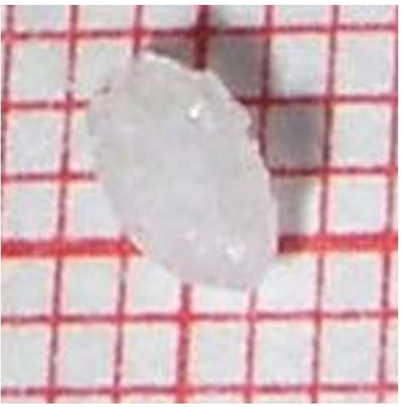
Fig. 4 Harvested SrNH<sub>4</sub>MgHPO<sub>4</sub> crystal