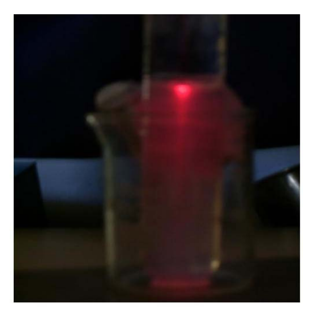
Fig. 3 Growth of SrNH<sub>4</sub>MgHPO<sub>4</sub> crystals in laser light exposed medium