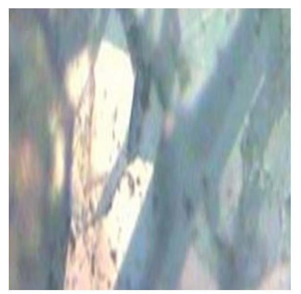
Fig-3 Etch photo of MnHP crystal at room temperature, HCL as an etchant, etching time - 7 minutes, etchant normality - 2N

A well-grown MnHP crystal was immersed in HCl solution at a desired concentration. The dissolution of MnHP crystal depends upon the etchant concentration, temperature, crystal morphology, etching time etc. [13-16]. The etch pits are shown in Fig-3. The etch pits observed in the photo are cone pits, leaf pits and step pits.