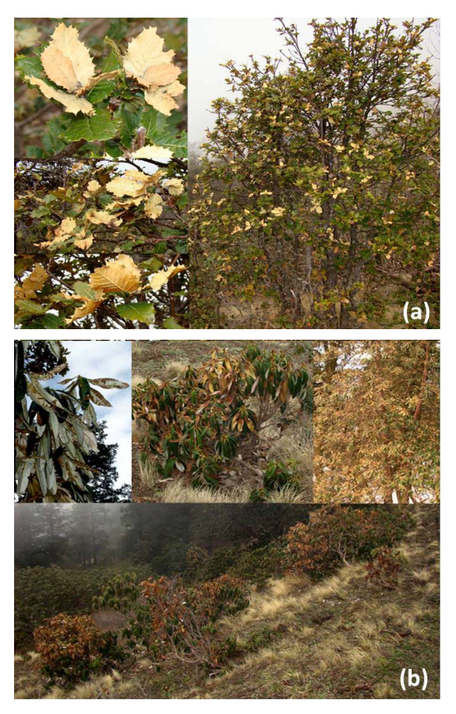
Figure 3. Foliar damage in Quercus semecarpifolia ; dried twig and leaves and tree (a); and foliar damage and mortality in Rhododendron arboreum at timberline ecotone (b).

In subalpine-timberline ecotone zones, mechanical damage in winters has conventionally been considered to be the result of desiccation stress [13]. The observed conditions indicate that species are more prone for damage due to the extreme events than steady inter-annual variations in the climate. The extreme climatic events tend to be much more important to initiate change in forest ecosystems than average climatic conditions [1,14,15]. The evergreen broadleaved species were affected more as compared to deciduous or needle bearing coniferous species. Studies related to the winter damage had prevalence of the coniferous species [13,16,17], whereas in the present observation conifers ( Abies and Taxus ) were found least affected. Being a broadleaved and evergreen species, Q. semecarpifolia, R. arboreum and R. campanulatum