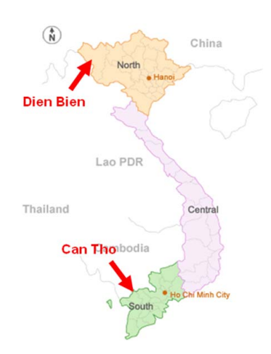
Figure 1. Vietnam map with the two pilot provinces.

VAAC decided that Treatment 2.0 would be piloted in two vastly different provinces of Vietnam: can Tho and Dien Bien (see Figure 1 ). There are several key differences between these two provinces, which make them