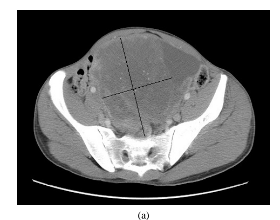
Figure 1. abdomino-pelvic CT showing heterogeneous masses arising from the pelvis measuring 195 mm (a) and 44 mm (b) long axis, with multiples lymph nodes and in intimate contact with intraperitoneal organs.