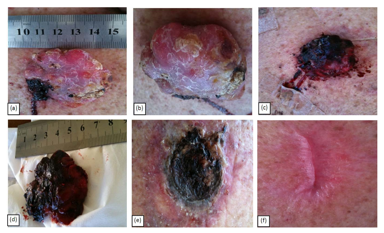
Figure 7. A large BCC, 5 cm \times 5 cm (a). protruding 1.5 cm from the skin (b) before combination intralesion—topical applications. Two days after the first intralesion injection the lesion started to breakdown (c). Two days after the second and final intralesion injection the lesion released itself from the skin (d). There was an indentation in the skin where the lesion had separated itself (e). From here-on the lesion was then treated for six weeks with topical application of Curaderm<sup>BEC5</sup> treatment only. Sixteen weeks after commencement of the combination treatment, there was no evidence of residual tumour (f). The observed scar tissue was probably from a previous surgical procedure. The cosmetic result was astonishing.

120 Intralesion and Curaderm<sup>BEC5</sup> Topical Combination Therapies of Solasodine Rhamnosyl Glycosides Derived from the Eggplant or Devil's Apple Result in Rapid Removal of Large Skin Cancers. Methods of Treatment Compared