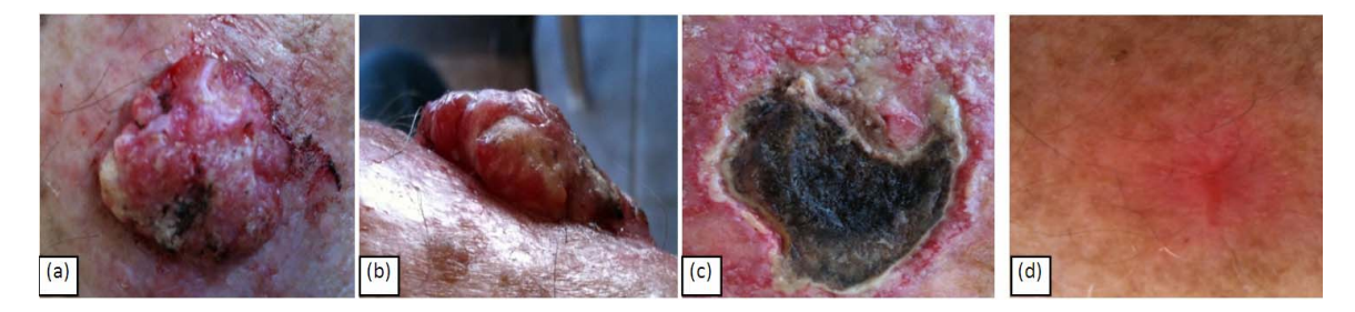
Figure 6. A large (a); protruding (b); BCC of approximately 1 \text{ cm} \times 3 \text{ cm} \times 3 \text{ cm} before treatment. Haemorrhagic necrosis of the tumour mass occurred during treatment with Curaderm<sup>BEC5</sup> (c). After 14 weeks of Curaderm<sup>BEC5</sup> topical application the lesion had completely regressed. The impressive cosmetic end result (d) is seen 16 weeks after commencement of Curaderm<sup>BEC5</sup> therapy.