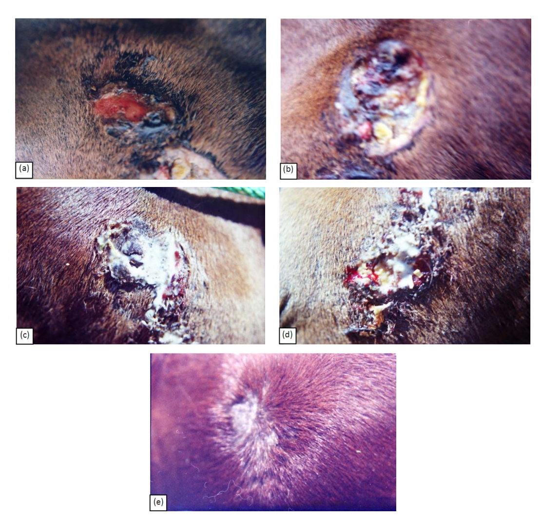
Figure 8. A melanoma on the chest of a horse before intralesion injection of BEC (a). After the first injection the lesion started to breakdown (b) and after the second and last intralesion administration of BEC, massive necrosis of the tumour was observed (c), (d). No further treatment was done after the second intralesion injection. Twelve weeks after intralesion injection of BEC, the melanoma was completely eliminated (e). There was no recurrence for at least 5 years after treatment.

Intralesion and Curaderm<sup>BEC5</sup> Topical Combination Therapies of Solasodine Rhamnosyl Glycosides Derived from 121 the Eggplant or Devil's Apple Result in Rapid Removal of Large Skin Cancers. Methods of Treatment Compared