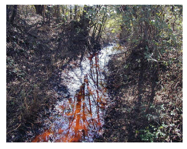
Figure 2. Glycerin polluting creek.

The Material Safety Data Sheet (MSDS) categorizes glycerin as an irritant but not necessarily a hazard for humans and animals [28]. Glycerin itself readily degrades in the environment. However, crude glycerin from a biodiesel plant has been described as the wastebasket of the biodiesel process, since much of the oil impurities, methanol and catalyst also go into this phase. These impurities could elevate the environmental risk of crude glycerin. To reduce its environmental impact, it is desir-