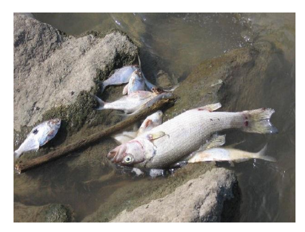
Figure 3. Over 25,000 fish killed in southeastern Missouri, due to illegal dumping of crude glycerin.

able to neutralize crude glycerin, depending upon the catalyst used in biodiesel production [27].