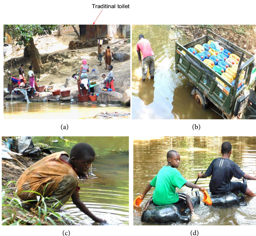
Figure 2. Showing photos of the Mamouwol stream. With a traditional toilet (a); a water merchant with cans and tricycle (b); teenagers: mechanic cleaning his hands and clothes, then drinking afterward, and boatman on old car tanks with shoes in hand (c), (d).