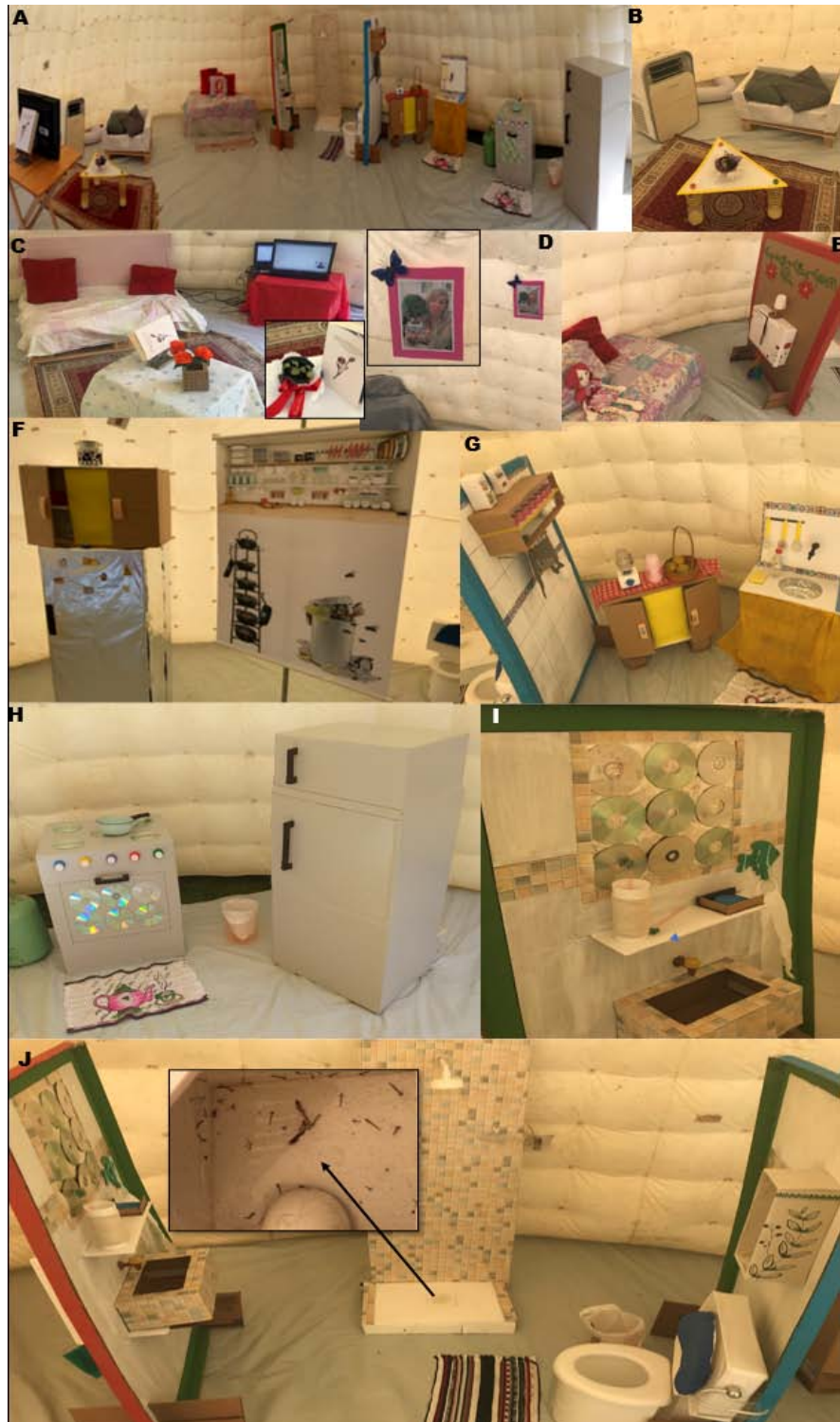
Figure 2. General view of the home setting, displaying most of its pieces of furniture (A). Details of the living room showing small table, sofa, air-conditioning system (B) a table with the TV presenting scientific videos and another with a book approaching the scientific legacy of Virgínia Schall (C), often placed besides an Evidengue® ((C), inset), with the Virgínia picture hanging on the wall ((D) inset) and a bedroom (E). House kitchen (F-H) and bathroom ((I) and (J)). Within the shower drain trap, living mosquito larvae are placed ((J), inset, arrow).