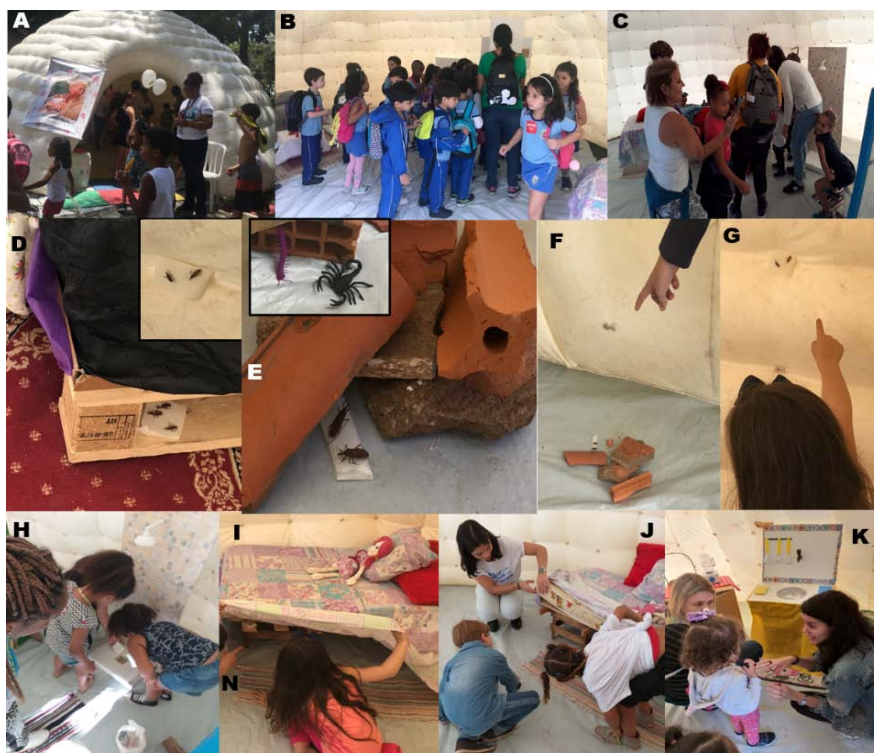
Figure 4. The interactive house is generally attractive, gathering many kids in schools and science fairs (A), (B) and they enjoy playing and taking pictures within it (C). Dead triatomines are tape-fixed under the bed or sofa (D) fixed on the walls ((D), inset) and by scrubs (E), (F), associated to centipedes, scorpions etc. Visitors are invited/challenged to search for and identify the bugs inside and outside the house, on the scrubs (F) walls (G), within the shower drain trap (H) under the furniture (I), (J) always aided by the project team (J), (K).

The public enjoyed taking part of the activity and interacted with the scenographic environment ( Figures 4(A)-(C) ), Different rubber-made arthropods such as roaches, ants, flies, centipedes and scorpions are placed at concealed dark spaces/hidden spots ( Figure 4(D) , Figure 4(E) ) such under furniture, within shoes and by scrubs as well on the trash.