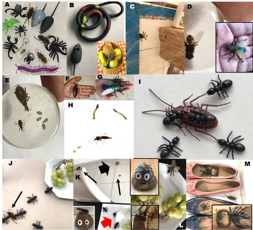
Figure 3. Rubber-made cockroaches, centipedes, spiders, scorpions etc. (A) are used in the activity. As mice and rats are often preyed by snakes a rubber snake is place near a toy mouse in some areas (B); Rubber mice are placed in trash or fruit bowl (inset). Rubber spiders are placed on glue-made webs (C). Transparent resin-incrusted (D), plastic flies (D, inset), incrusted kissing bugs (E) and mosquitoes (H) are presented during the visits. Lange battery powered cockroach (F) and fly (G) are also employed in brief theatre sketches during the visit. Rubber-made ants are shown feeding on roaches (I), as well as on our food (J arrow—rubber cockroach). Sometimes toy assemblages are arrayed to display plastic ants (K) and house flies (L) on top of gel-made dog stools (upper inset) as well as on food dishes with fruits or bread (lower inset). Rubber arthropods placed within shoes (M), where scorpions are represented preying on roaches (inset).

[55]. The team tutors ask: “Would anyone here discard a delicious fruit juice in the tropical summer after detecting a poor, little, drowning ant?” Usually the unanimous answer is “no”. The answer is quite different when we consider a swimming cockroach. At the end we ask them: “Ok, you can save the ant, but can you save yourself from its microbes?”