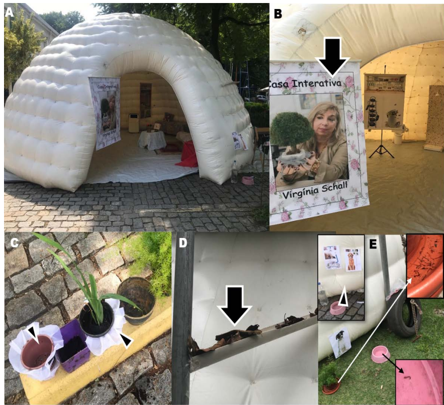
Figure 1. Educative, interactive, ludic implement named “Interactive House” (“House with no viruses and other bugs”), honoring Virgínia T. Schall (in memoriam), mounted on an inflatable igloo, devised for demonstration breeding sites and hiding spots of vectors such as Aedes aegypti and triatomids, as well as house colonization by other animals harmful to health. House entrance (A), (B) with a banner depicting the researcher Virgínia Schall showing Evidengue” ((B), arrow), a device crafted in cloth to block mosquito oviposition on the water-accumulating saucer ((C), arrowheads). A leaves-clogged gutter showing water accumulation ((D), arrow). Peridomicile (E) presenting plant pot with saucer displaying water with living larvae (white arrow—top right inset), used tire near dog bowl with water (and eventually larvae, black arrow—bottom inset), with images showing dogs and the Leishmania life cycle (top left inset, arrowhead).

The choice of items for the composition was based on houses in the suburbs of Rio de Janeiro (not too different from most residences in low income areas of