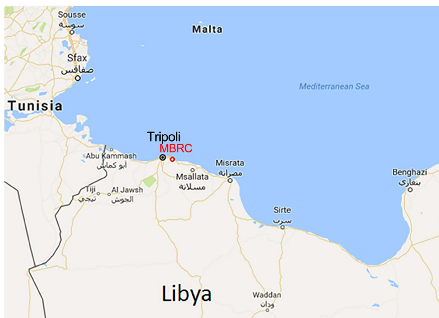
Figure 1. Localization of the collection site of algae.

Experiments were carried out in a domestic (Black & Decker, Model No. MZ