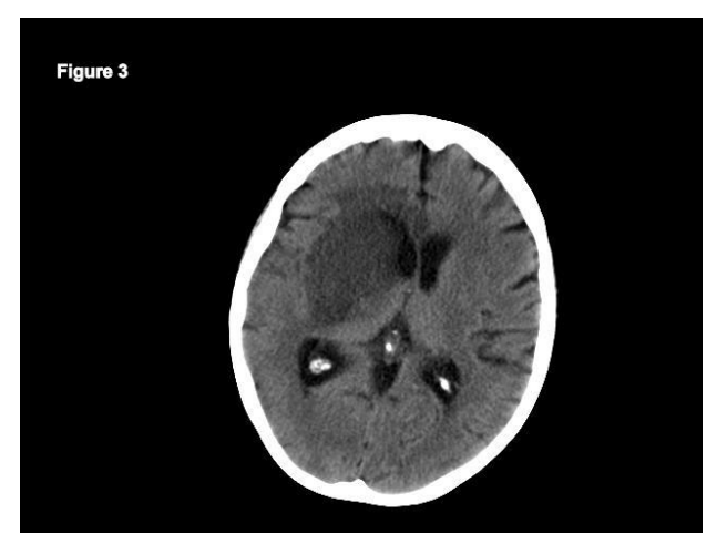
Figure 3. BrainCT demonstrating ill-defined hypodensity of right basal ganglia, portions of the caudate head, putamen and globus pallidus.

were identified in areas of inflammation and necrosis. Neuropathology showed subacute infarct involving the right basal ganglia and right temporal lobe. Special stains of brain tissue revealed fungal hyphae with morphology consistent with Mucor ( Figure 4 ). Right kidney showed infarction with mucor infection as well as fibrotic crescents consistent with treated GPA. Heart pathology demonstrated cardiomegaly with atherosclerosis and unremarkable heart valves.