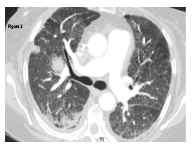
Figure 2. Repeat chest CT demonstrating new right hilar opacity, multiple other softtissue opacities, some with-cavitation and air-bronchograms.

acin, vancomycin and piperacillin/tazobactam. Blood and sputum cultures were negative. Despite therapy, lowgrade fevers continued. Caspofungin was added for empiric fungal coverage. Bronchoscopy was scheduled but hypoxia persisted and the patient developed atrial fibrillation with rapid ventricular response. Anti-coagulation was not initiated because of persistent hemoptysis. Patient became lethargic but arousable. Her speech was slurred with paresis of the right lower face and she had left arm weakness. The weakness progressed with leftsided paralysis. Motor examination revealed decreased strength of 3/5 on the left side. Sensory exam was normal. Brain CT revealed an ill-defined hypodensity involving the right basal ganglia, portions of the caudate head, putamen and globus pallidus ( Figure 3 ).