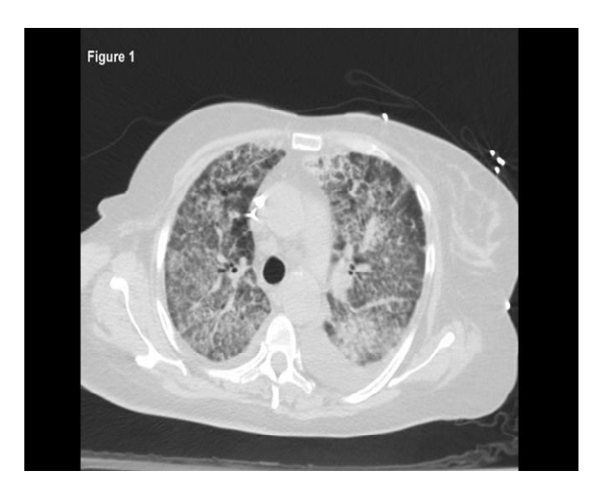
Figure 1. Chest CT on admission demonstrating diffusebilateral ground-glass opacities and effusions.

The patient was initially treated with intravenous vancomycin and meropenum for 10 days for presumed HCAP, aggressive diuresis (IV furosemide) and continued on hemodialysis. She was continued on CYC therapy. The shortness of breath improved but continued to have intermittent hemoptysis. Two weeks after admission, fever (101.1°F) and right-sided respirophasic chest pain occurred. Hypoxia worsened and required BIPAP. A repeat CT scan of chest revealed persistent diffuse ground glass opacities with new right hilar opacity measuring 1.9 cms × 1.7 cms and multiple other soft tissue opacities in the right lower lobe; some were solid and some with cavitation; air-bronchograms were also noted ( Figure 2 ). The pleural effusions had decreased in size. On hospital day 19, intravenous antibiotic therapy was restarted with ciproflox-